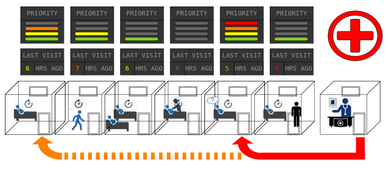
Fig. 1: A schematic representation of the developed system's purpose and application.